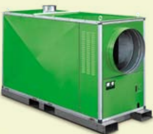
REMKO HTL 180