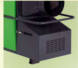
Closed burner housing