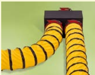
Operation with multi-connection adapter and hot air tubes REMKO ELT 18-S