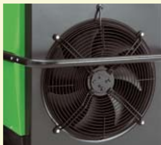
Efficient, especially optimised sickle fans