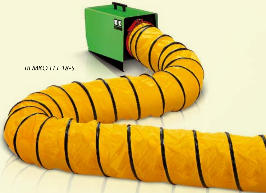
REMKO ELT 18-S

The hot air can be easily conducted to where it is needed. This solution is well-suited for heating or drying of shafts. The tube length can amount up to 15 m. With a multi-connection adapter, two hot air tubes can be connected.