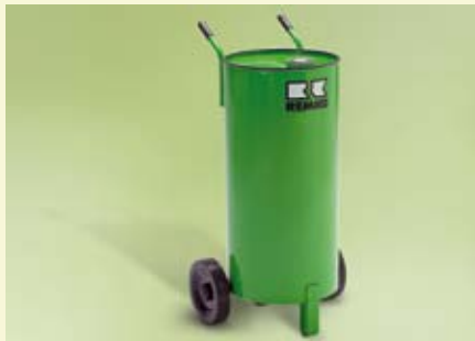
Oil tank, 60 litres, with tank heater and chassis