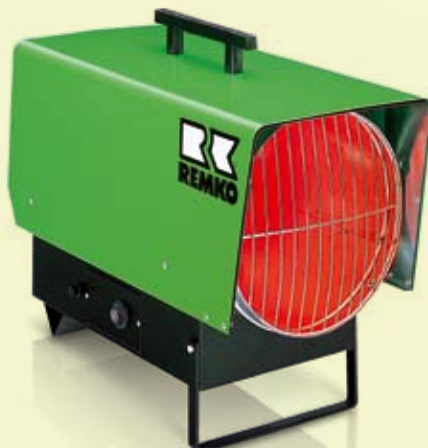
REMKO PGT 60