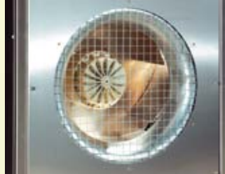
Special REMKO Flying-Bird radial fans for the HTL line