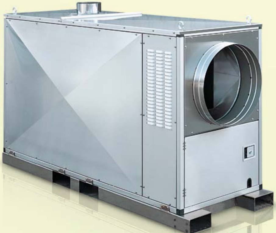
REMKO HTL 250