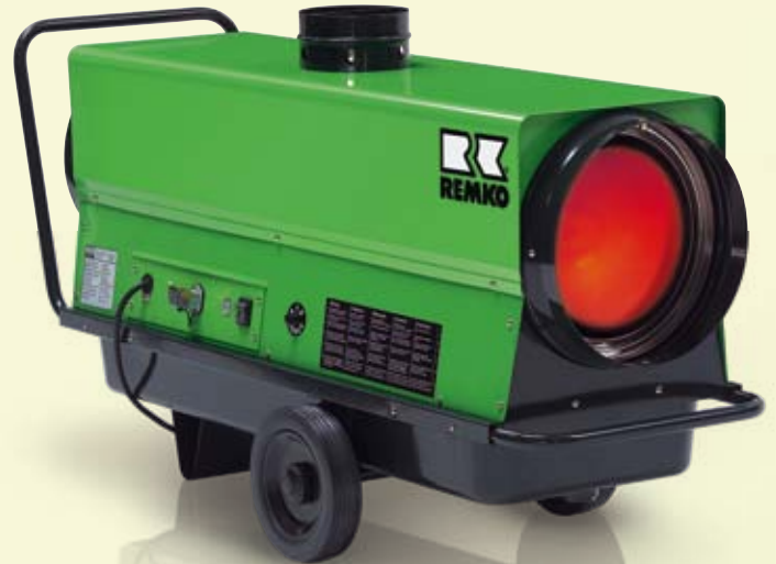
REMKO ATK 25