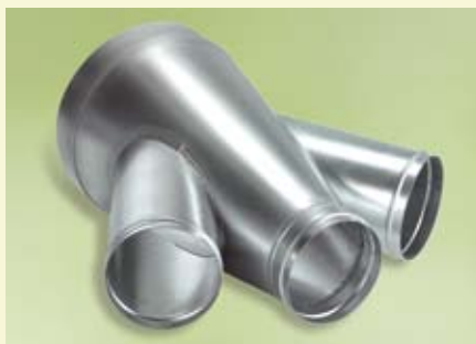
Multifunctional air distributor heads, 3 capacities