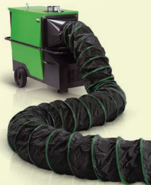
REMKO CLK with hot air tube operation