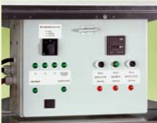
Switch box with operating hour counter, installed in protected housing