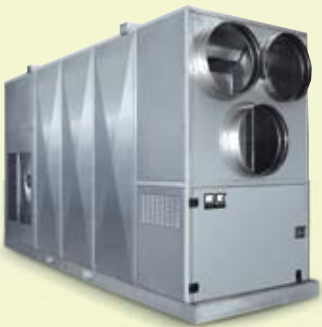
REMKO HTL 400