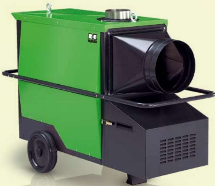
REMKO CLK 50