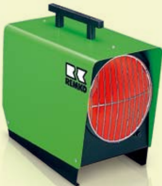
REMKO PGM 30