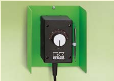
Moistureproof room thermostat, Type RT-5, ready for plug assembly low switching difference, Type of protection IP 54, incl. 10 m moistureproof room cable, connecting plug, and protective unit of lacquered sheet steel