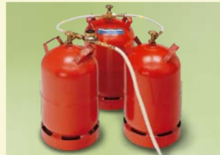
Multi-cylinder set for the connection of 2-3 gas cylinders