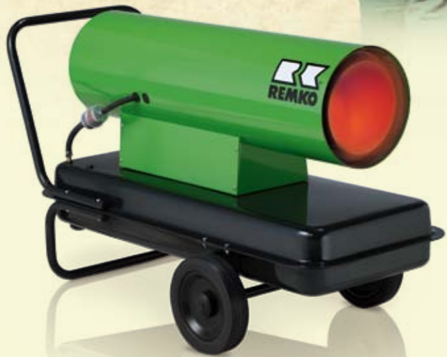
REMKO DZH 30-2