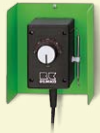
Moistureproof room thermostat, IP 54 Ref. nr. 1011250