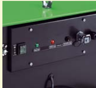
Switch and control panel in a user friendly arrangement