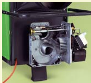
Service friendly oil burner