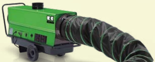
REMKO ATK 25 with hot air tube operation