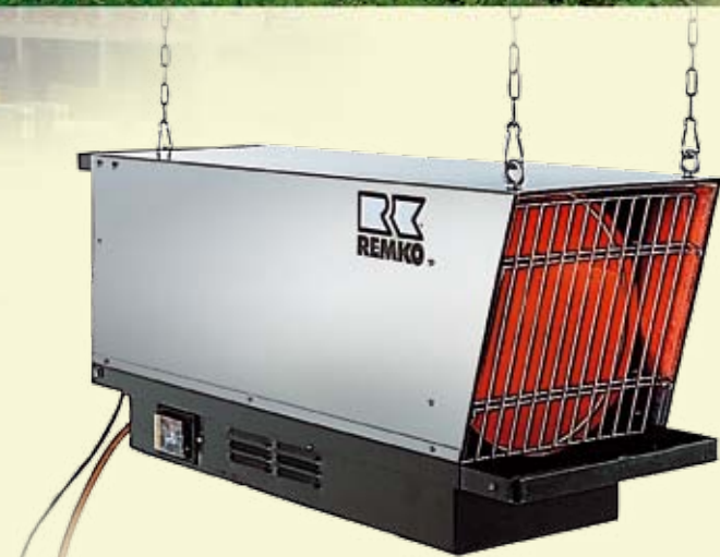
REMKO PGT 100 INOX design