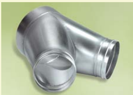
Multifunctional air distributor heads, 2 capacities