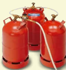
Multi-cylinder set Ref. No. 1014050