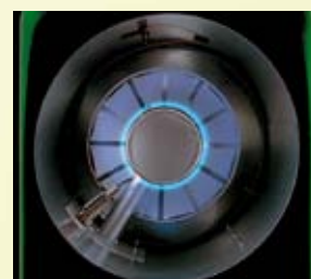
Effective combustion due to multi-point injection