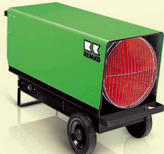
REMKO PGT 100