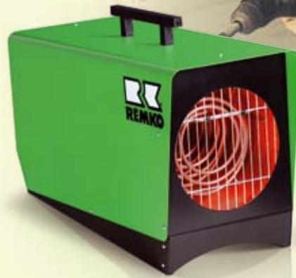
REMKO ELT 10-6