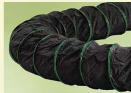
Hot air tubes, 7.6 m long, incl. tube fastening strap