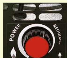
Built-in power regulation for infinitely variable power control