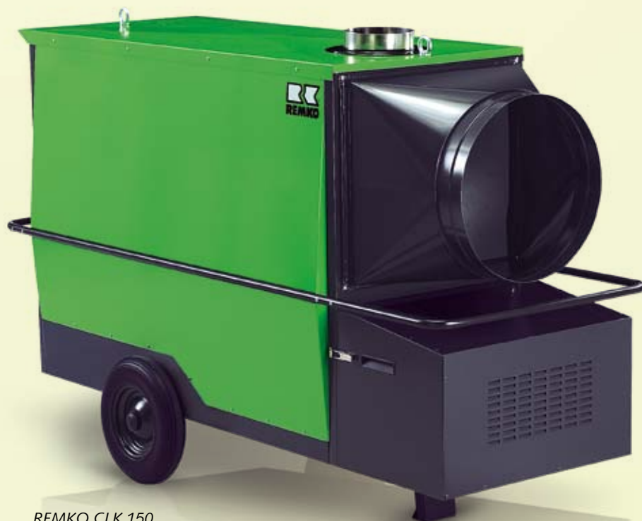
REMKO CLK 150