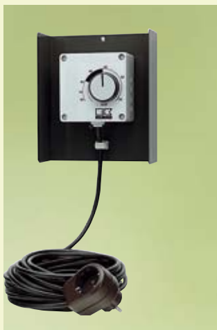
REMKO Room hygrostat, Type HR-1, for fully automatic control, ready for plug assembly

A fan built into the unit conducts the moist room air through an evaporator and cools it below the dew point. In this way, the excess water vapour is exuded as condensate and can be conducted to a water tank. The dehumidified air is blown out again when moisture is removed.