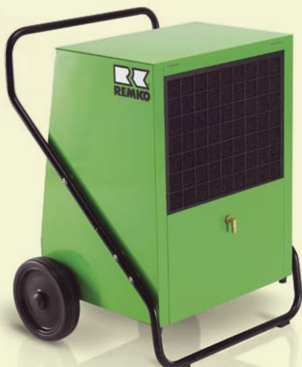
REMKO AMT 110-E