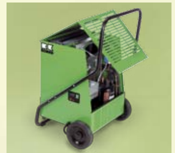
Easy service due to a easy access panels