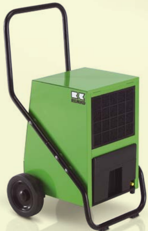
REMKO AMT 40-E