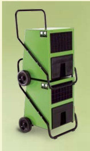
REMKO Dehumidifier are stackable

The REMKO dehumidifiers functions as follows: