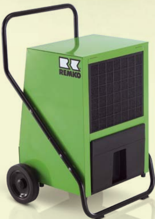
REMKO AMT 80-E